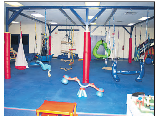
The gym offers a variety of equipment and activities that are specifically designed for children dealing with spectrum disorders.

"We understand and often tell our parents, 'You don't have to apologize for your child